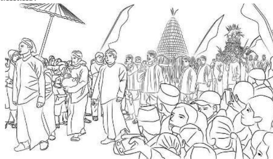
Figure 4. Tuk Si Bedug Procession (Kirab Tuk Si Bedug)

Fourth, the Tuk Si Bedug kirab procession. This kirab has become a distinctive feature of Margodadi Village because it serves as a unique attraction for spectators, both local residents and visitors from outside the region. The kirab is a parade of gunungan containing agricultural products from the local community, arranged systematically along a predetermined route. The most prominent static visual element is the agricultural produce arranged in the form of gunungan . According to Fransisca (2021), the pointed shape of the gunungan symbolizes a reminder that all things will ultimately return to the Creator, or in Javanese philosophy, Sangkan Paraning Dumadi . There are several types of gunungan representing different sectors, including gunungan cetil , gunungan wuluwetu , and gunungan robyo . Gunungan cetil (a traditional food from Grogol Hamlet) symbolizes prosperity and unity within the community. Gunungan wuluwetu , which contains the community's agricultural harvests, symbolizes gratitude to Allah SWT for abundant crops. Meanwhile, gunungan robyo , formed from rice and various side dishes, symbolizes the relationship between humans and God as well as the relationship among fellow humans.