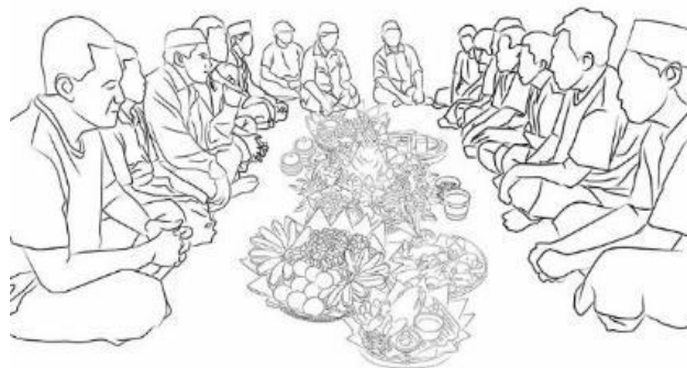
Figure 6. Central Pattern in the Kendurian Procession (Source: Sketch by Sherly Fransisca, 2022)

Second, the kendurian procession. The dynamic visual element clearly illustrated in the figure below displays a central pattern in which the tumpeng and all of its ubarampe become the focal point of the activity. Similar to all living creatures on earth, when there is a source of food, people naturally gather around and surround it. The central pattern also functions as a geometric center that creates a symmetrical, formal, stable, and orderly balance. In Javanese philosophy, this arrangement is associated with equality of status, emphasizing that within society people should practice tolerance, appreciation, and mutual respect toward one another.