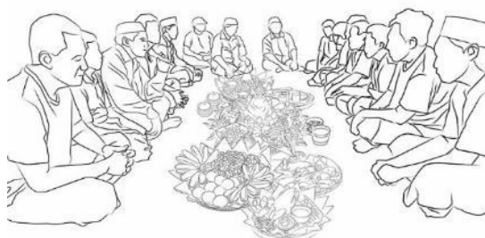
Figure 2. Kenduri Pamidhangan

Finally, there is udhik-udhik in the form of coins, symbolizing the importance of giving alms or charity when one has excess wealth. Another additional ubarampe found specifically in Grogol Hamlet is tumpeng cetil , which symbolizes unity and emphasizes that humans should cooperate and practice mutual assistance ( gotong royong ).