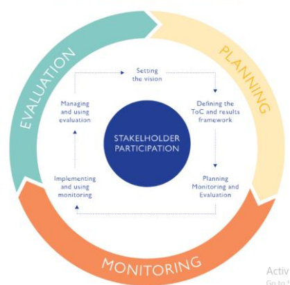
Figure 5.1: Planning, monitoring and evaluation cycle 41

All stakeholders in the school environment participate in designing the school program or school framework and this is outlined in the school plan which is then monitored in the implementation of the program that has been designed and carried out an evaluation at the end of the program that has been implemented.